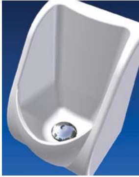
Britex Arid Waterless urinal